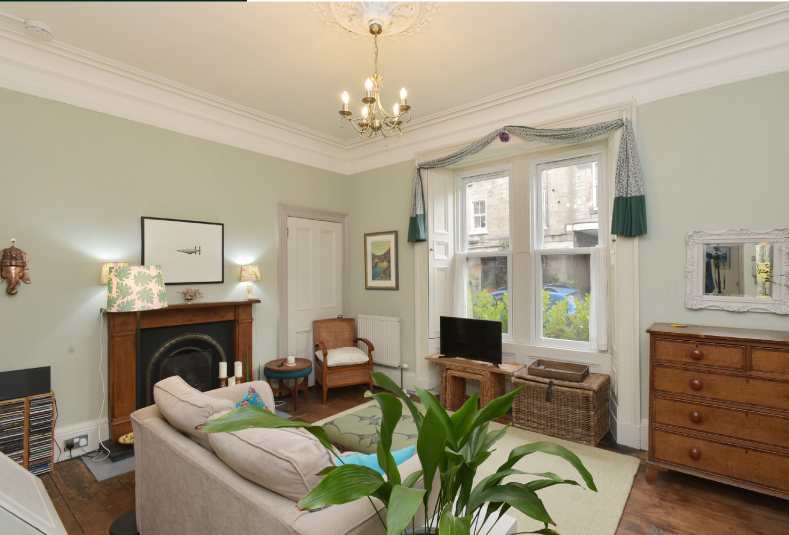
SPACIOUS ONE BEDROOM GROUND FLOOR FLAT