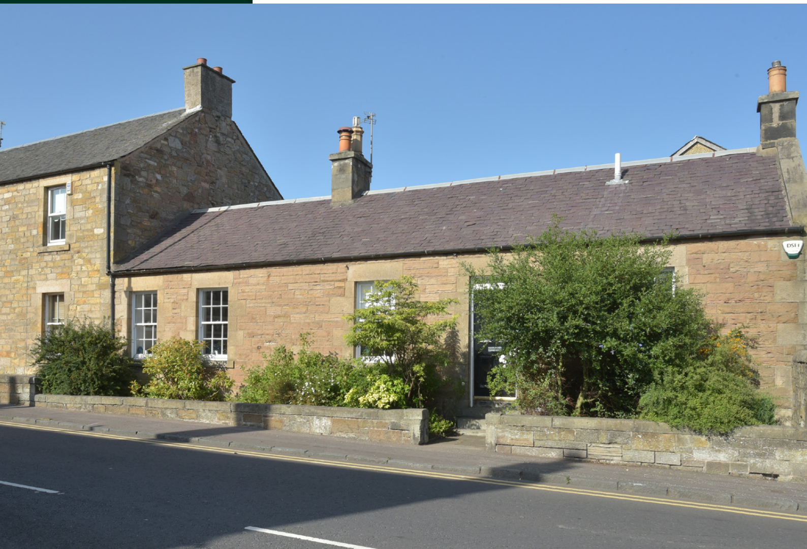
TWO BEDROOM COTTAGE IN GILMERTON