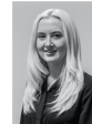
Professional photography ERIN MCMULLAN Photographer