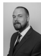
Professional photography GRANT LAWRENCE Photographer