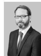
Professional photography CRAIG DEMPSTER Photographer