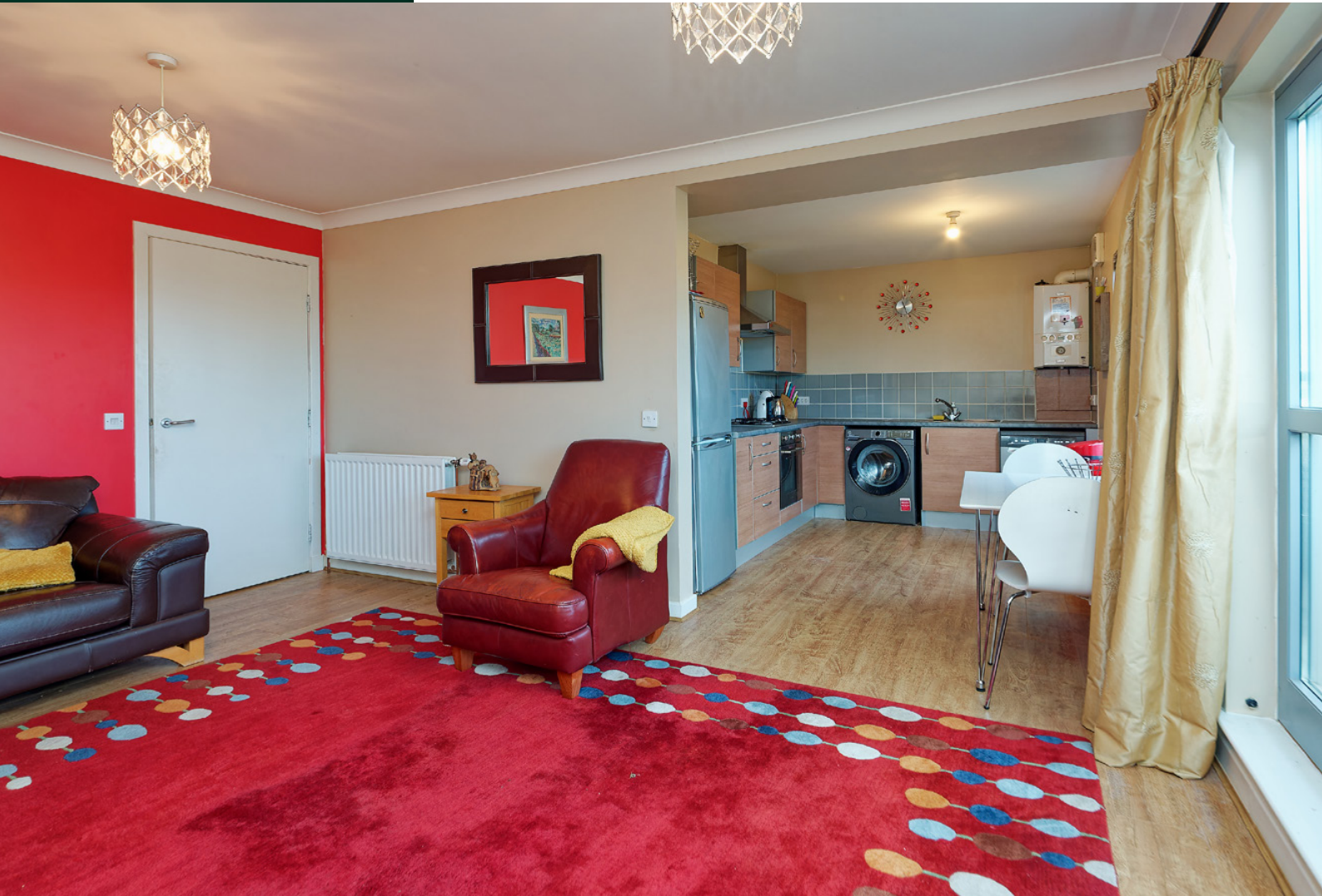
MODERN TWO-BED APARTMENT IN GLASGOW