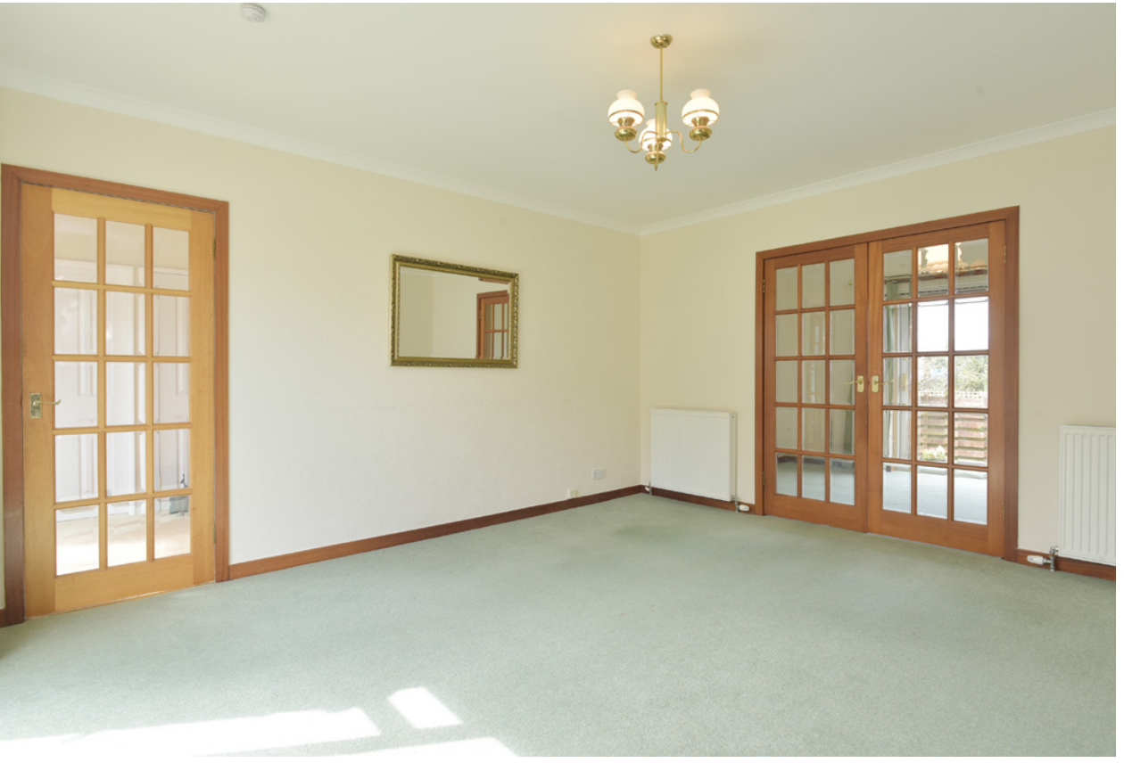
Inside, the property comprises of a spacious living area with large windows overlooking the front garden and is flooded with natural light.