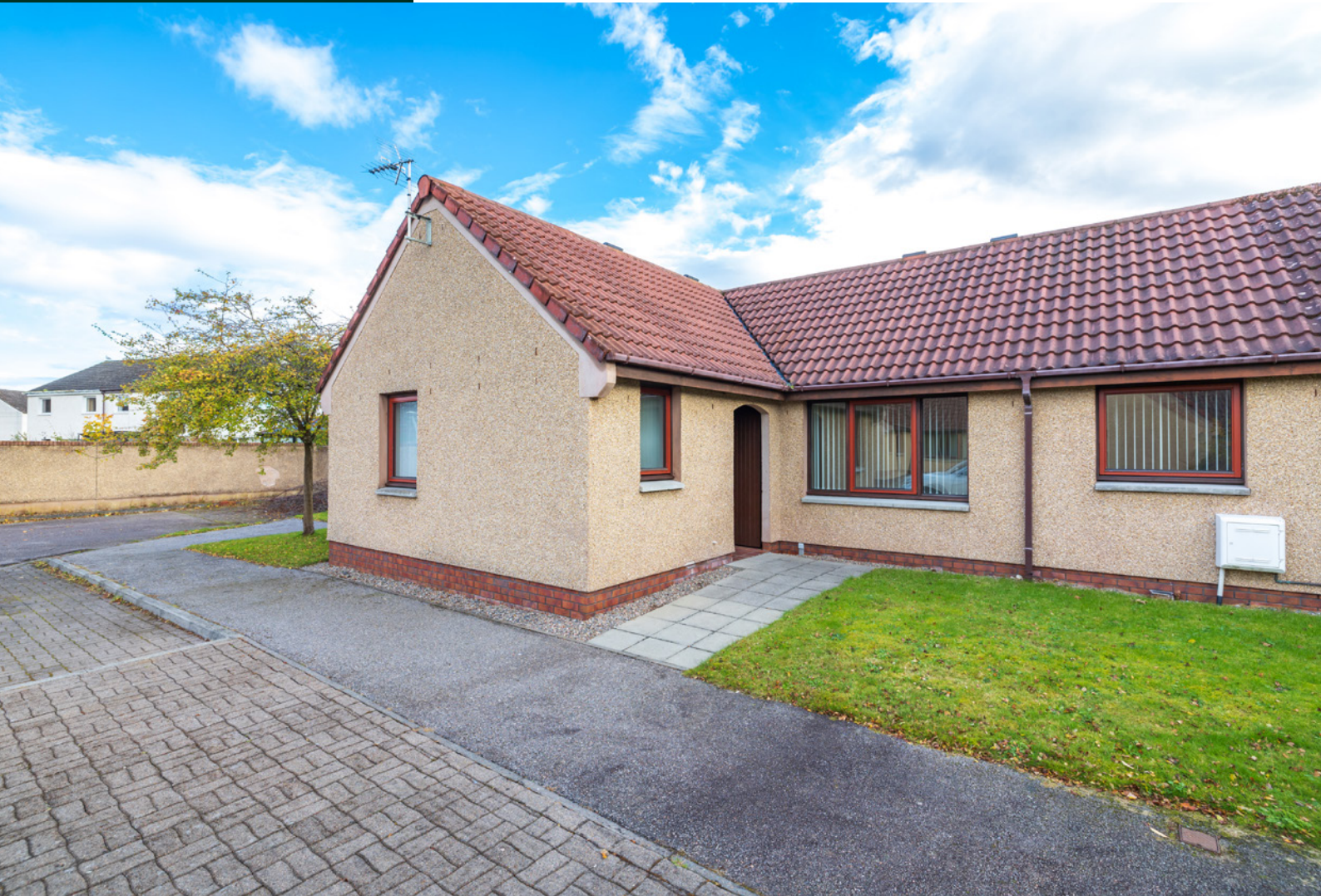
CHARMING 2-BED SEMI-DETACHED BUNGALOW