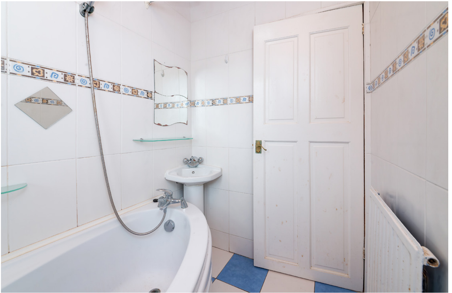
The tiled bathroom contains a white suite and a mains-fed shower over a corner bath, ensuring plenty of hot water for showering.