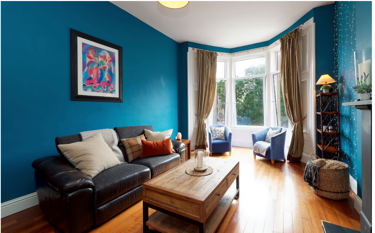
The spacious lounge features newly fitted double-glazed sash and case windows that flood the space with natural light. An original fireplace adds character and charm, while modern radiators provide contemporary comfort.