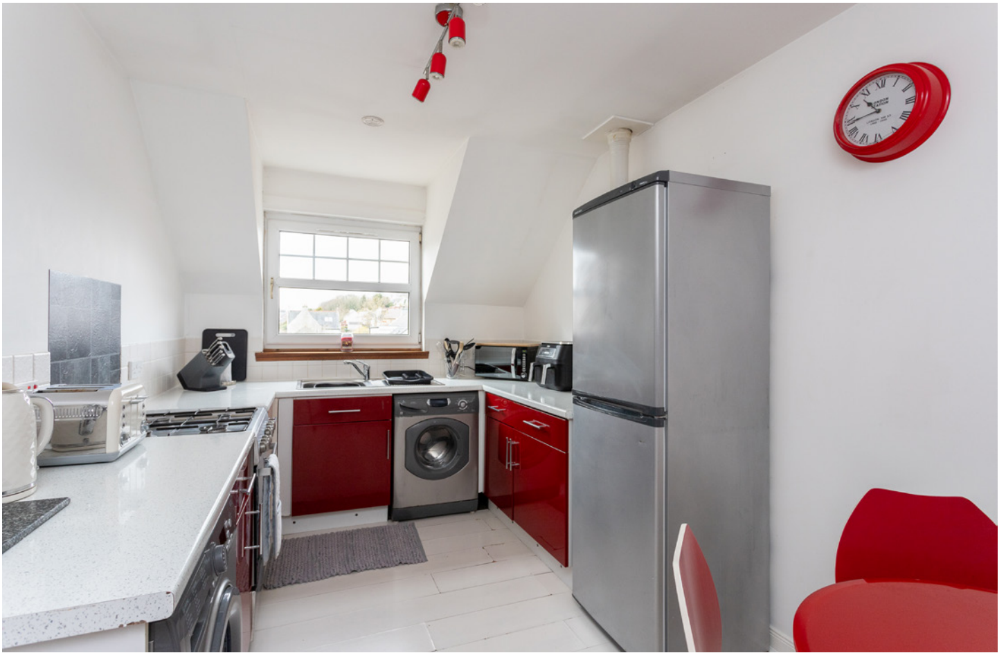
The kitchen is modern and is complete with a cooker, fridge, and washing machine.