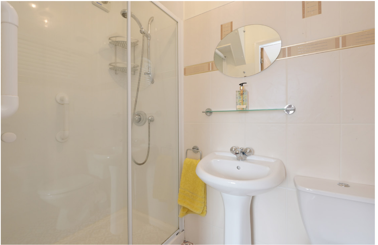
The downstairs shower room and WC includes a walk-in shower cabinet and benefits from a modern suite and a chrome heated towel rail.