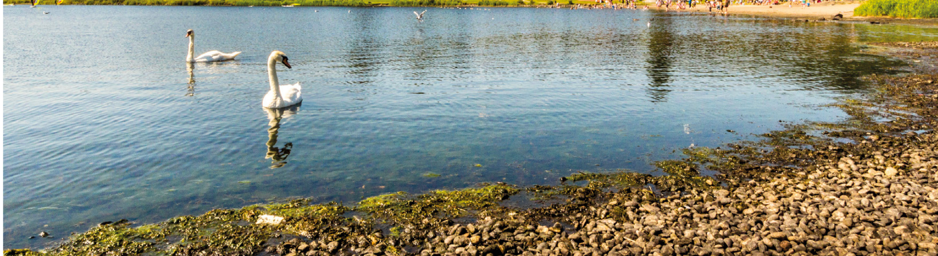
Keltybridge, Kelty Church, Lochore Meadows Country Park