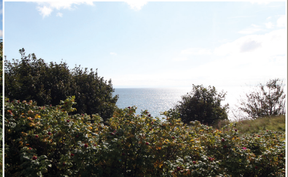
LOWER LARGO BEACH, LUNDIN LINKS GOLF CLUB, LOWER LARGO VIADUCT & ROBINSON CRUSOE.