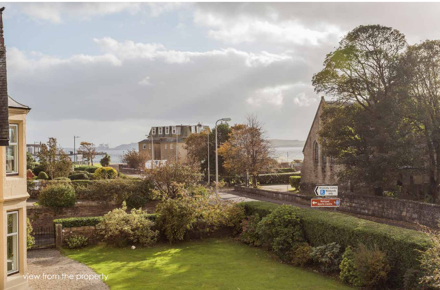
view from the property