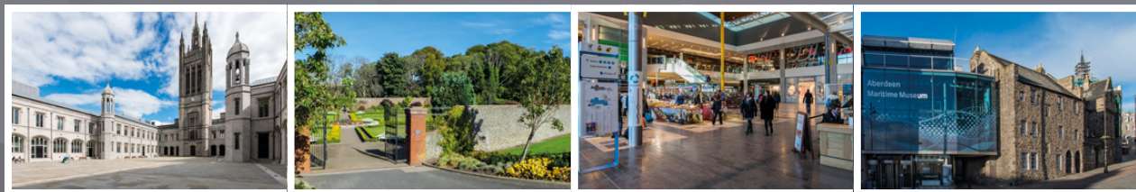
Marischal College, Persley Walled Garden, Union Square, Maritime Museum