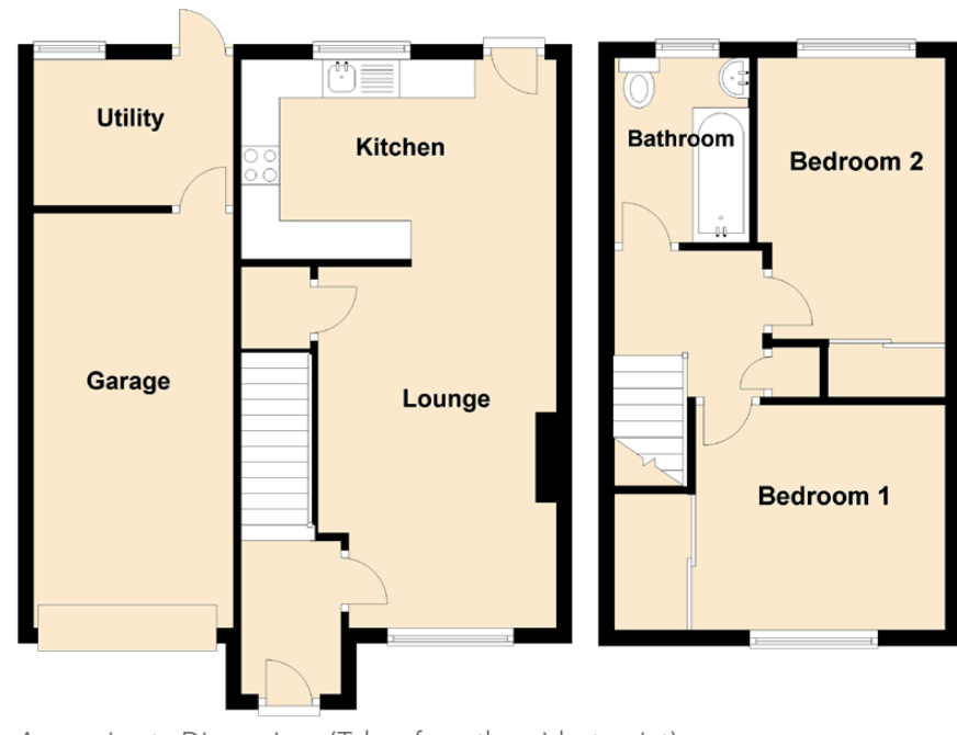
Approximate Dimensions (Taken from the widest point)