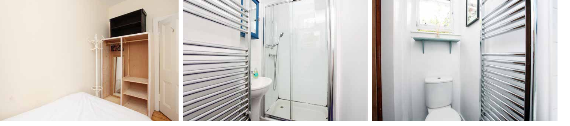
HALLWAY, BEDROOM & SHOWER ROOM