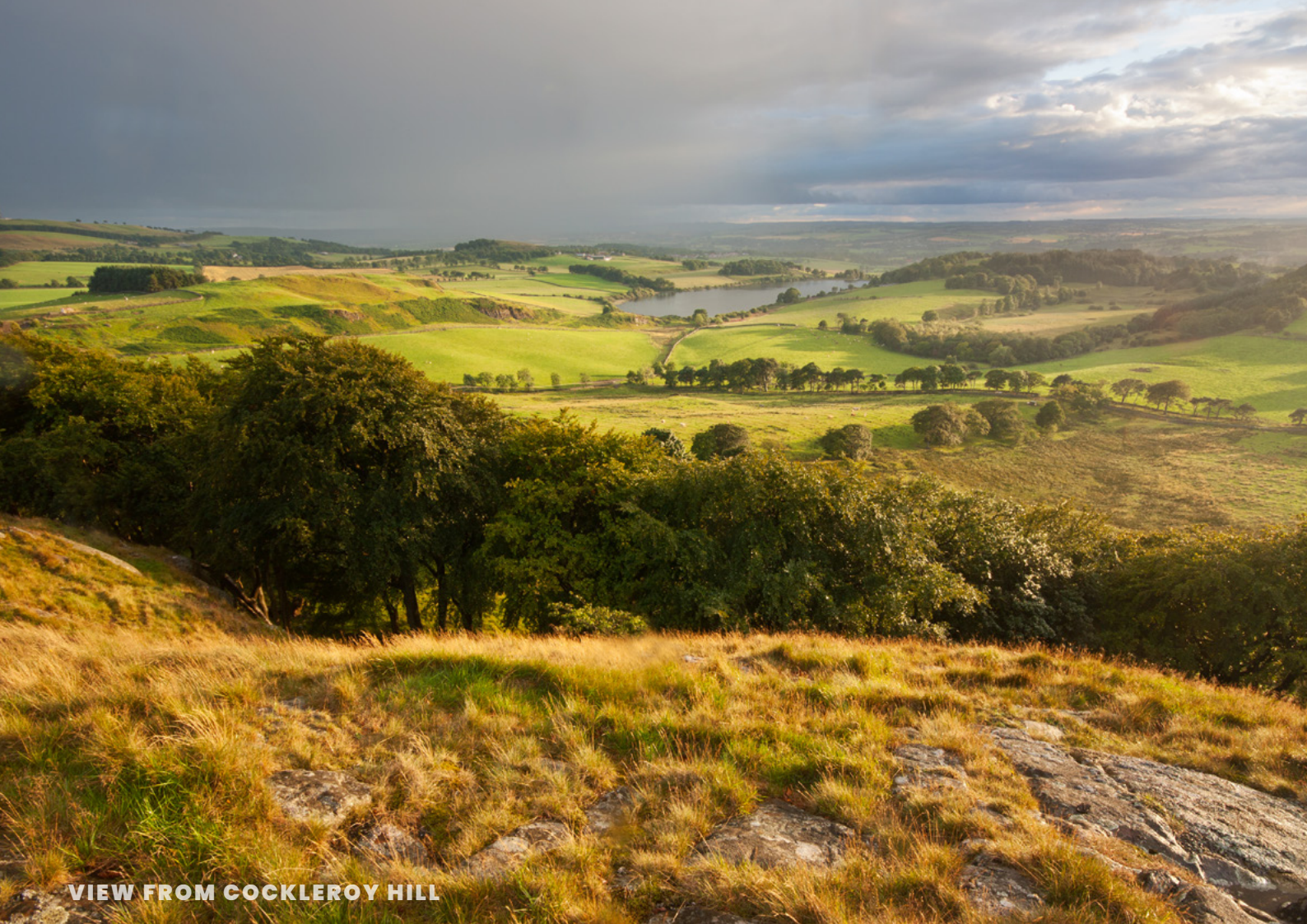
VIEW FROM COCKLERoy HILL

Lincroft is a beautiful property that is located on the outskirts of West Lothian in the Royal Burgh of Linlithgow. Steeped in history, the birthplace of Mary Queen of Scots. local shops are within walking distance from the property in Avonbridge.