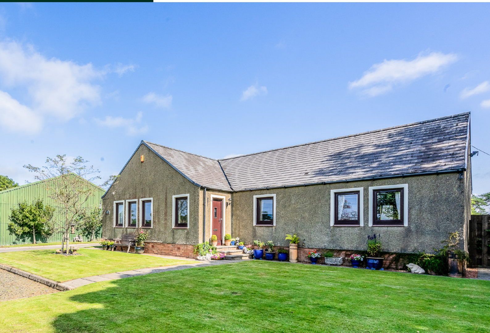
BEAUTIFUL FOUR BEDROOM BUNGALOW ON A LARGE PLOT