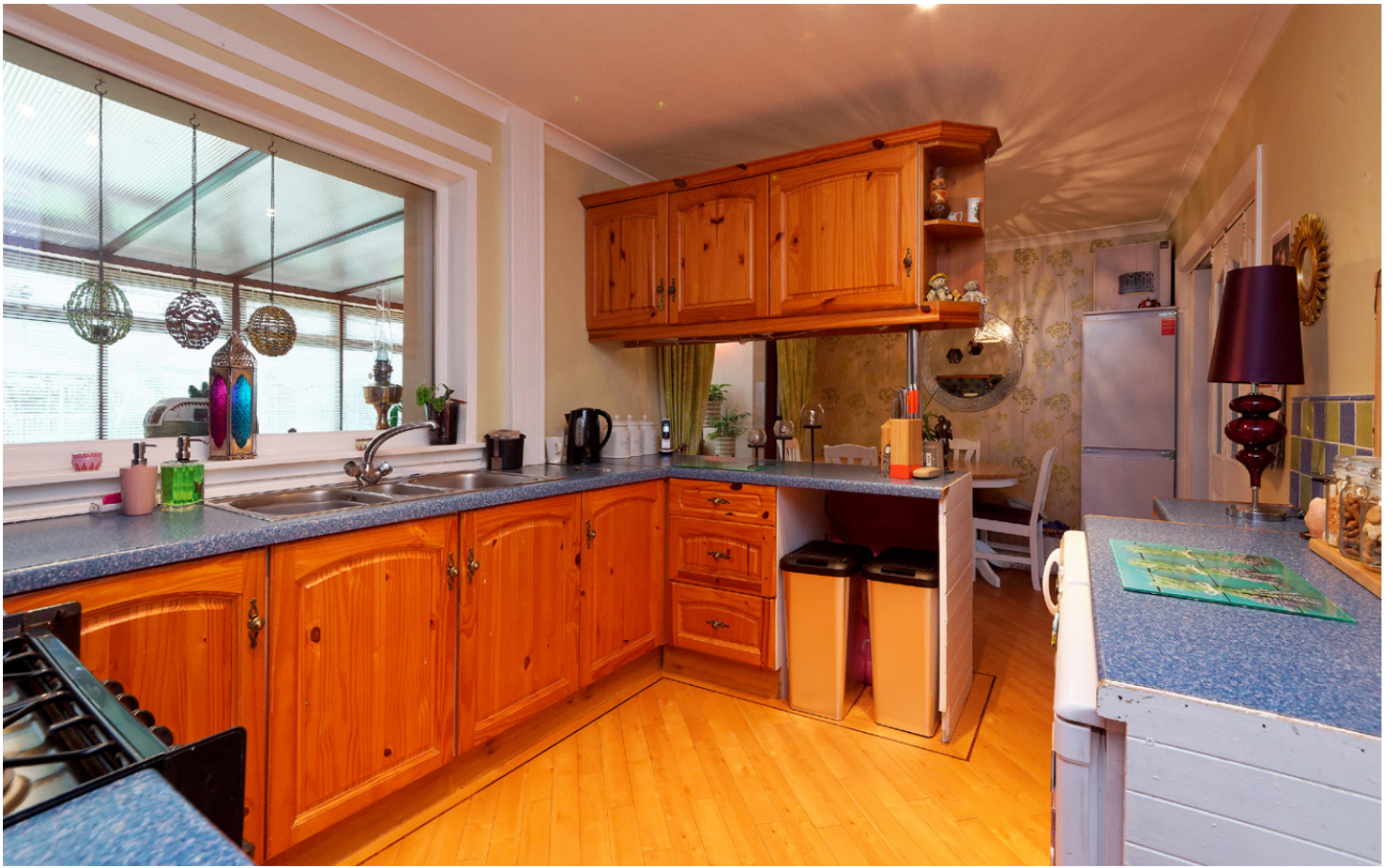
The dining kitchen has a range of floor and wall mounted units with a striking worktop, which provides a fashionable and efficient workspace.