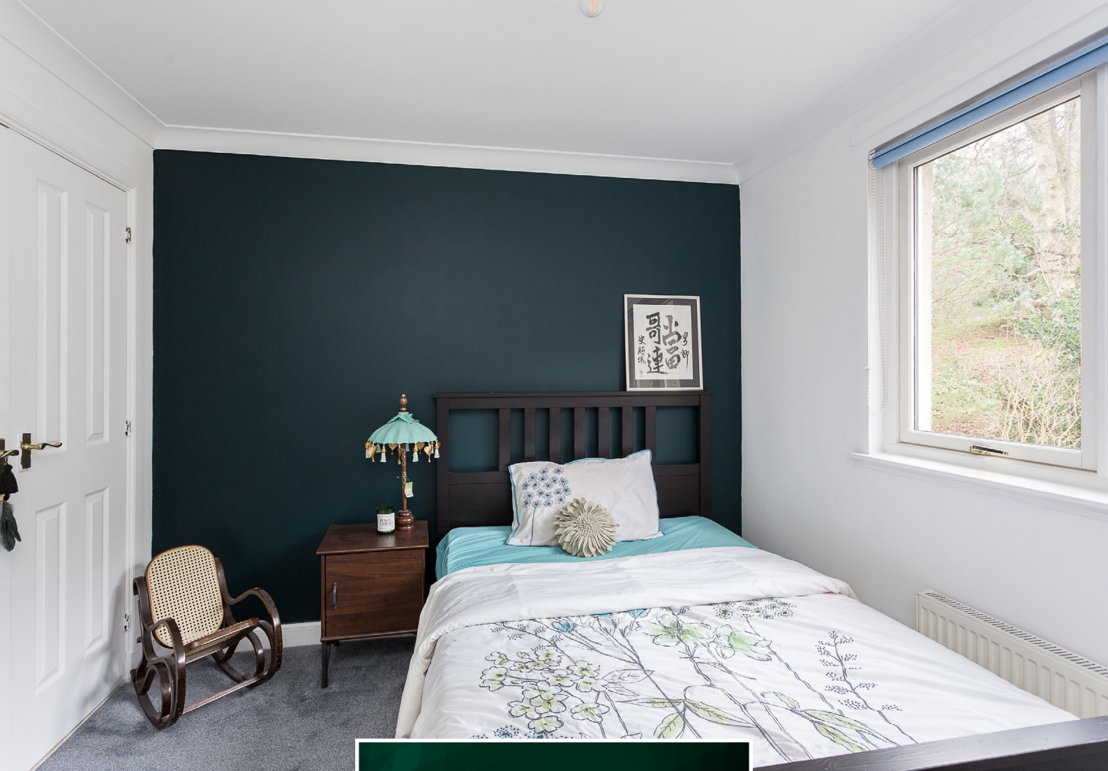
Bedrooms 3 & 4