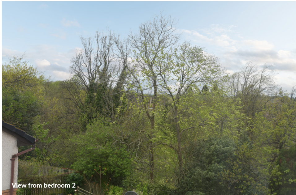
View from bedroom 2