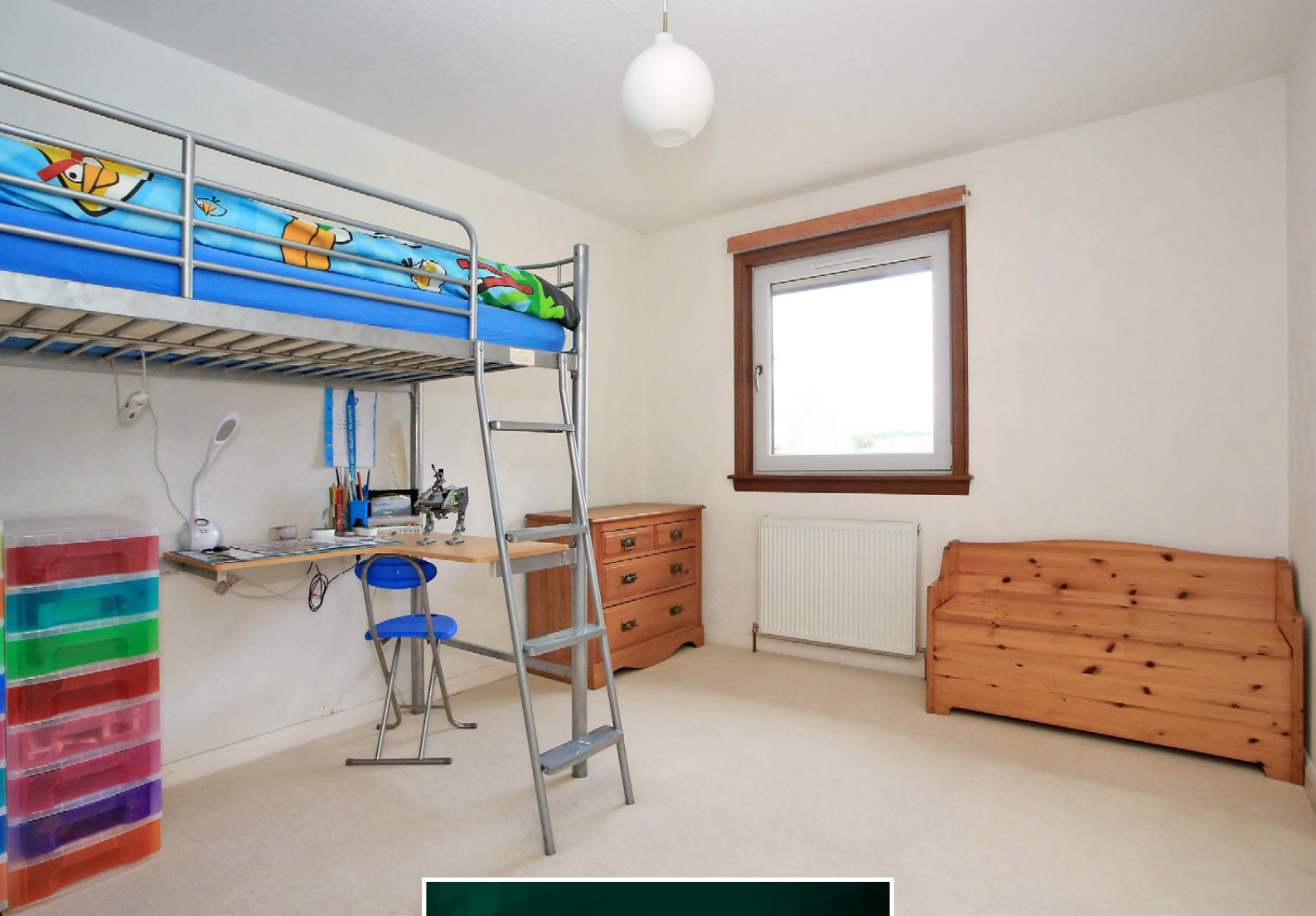
Bedroom 2 & 3