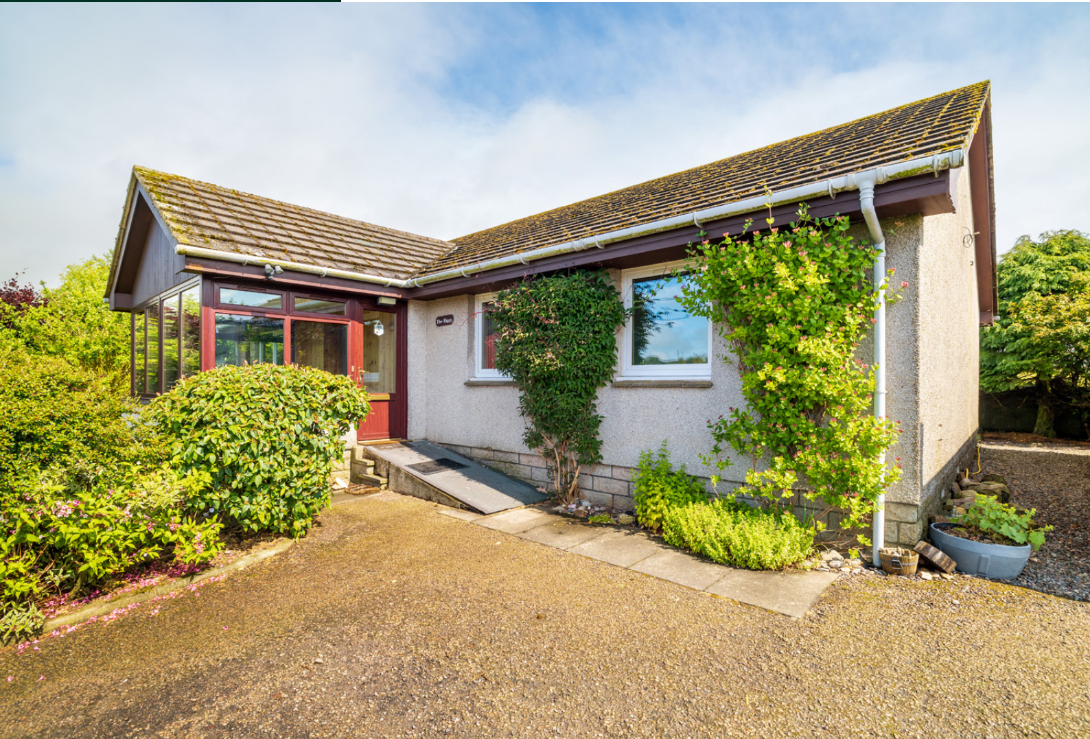
DETACHED THREE BEDROOM BUNGALOW

HATTON FARM ROAD, HATTON, ABERDEENSHIRE, AB42 0LL