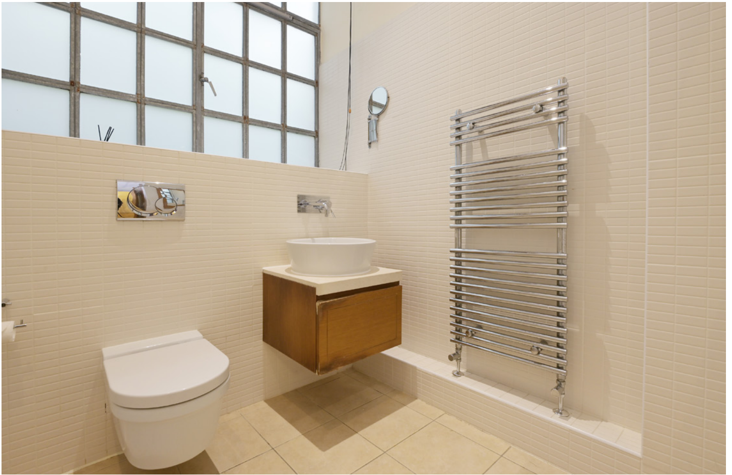
The main bathroom is fully tiled white with a modern three-piece suite and chrome towel rail.