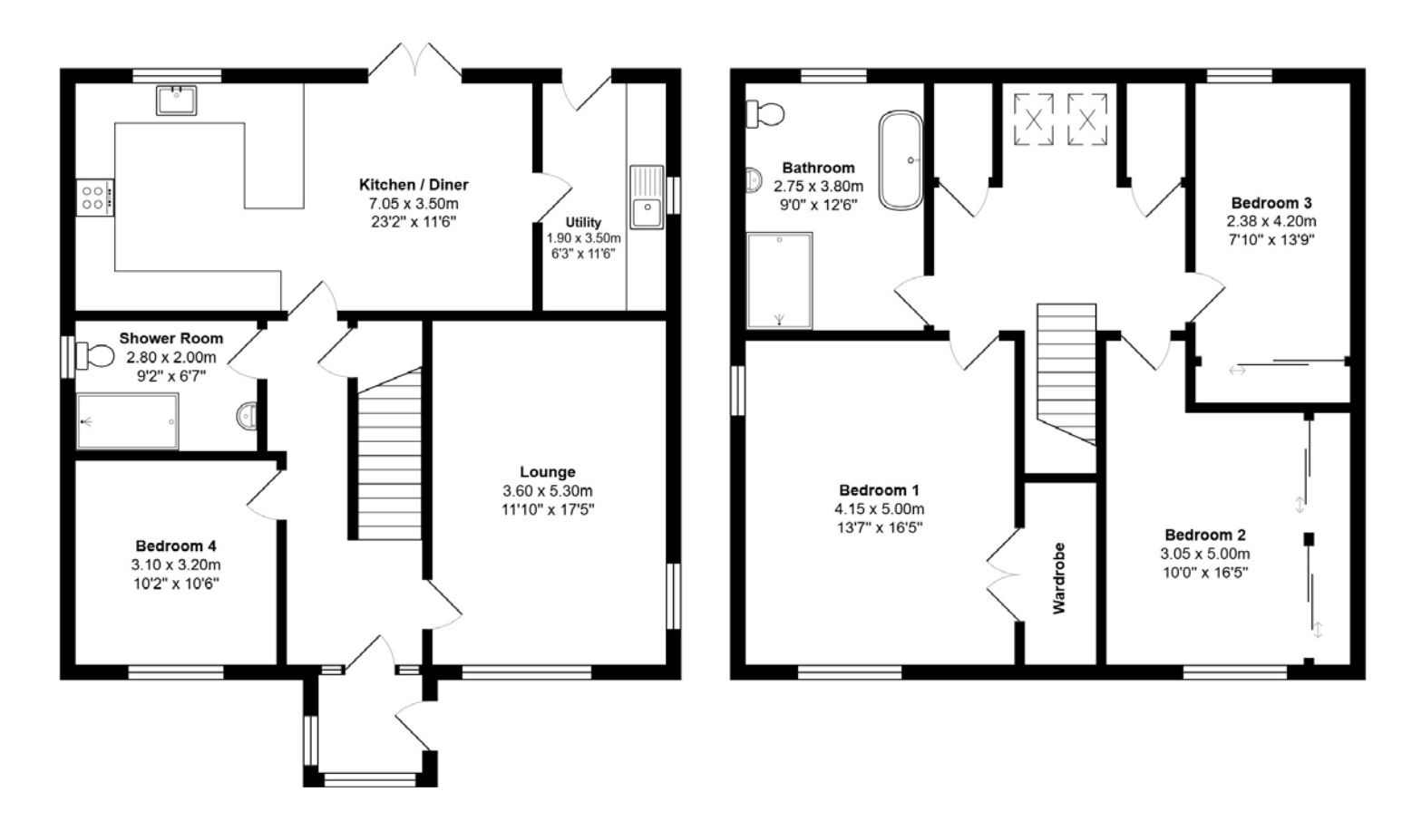
Approximate Dimensions (Taken from the widest point)

Gross internal floor area (m<sup>2</sup>): 163m<sup>2</sup> | EPC Rating: C