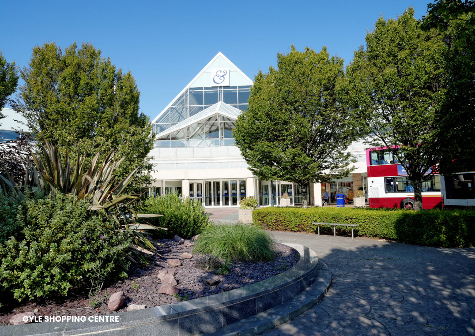
GYLE SHOPPING CENTRE

Craigmount is a well-established and sought-after residential area located in the western suburbs of Edinburgh, offering an excellent balance of suburban tranquillity and convenient city access. Known for its tree-lined streets, spacious homes, and family-friendly atmosphere, Craigmount is particularly popular with professionals and families seeking a peaceful setting within easy reach of the capital's amenities.