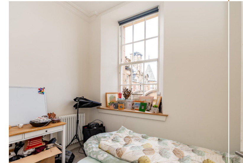
BEDROOMS THREE &amp; FOUR