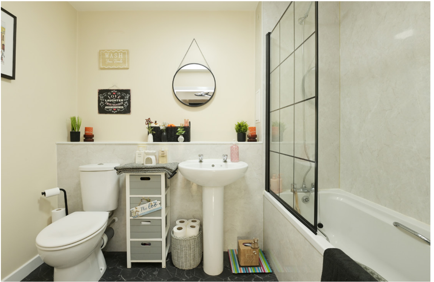
The property is completed by the bathroom white has a contemporary finish and a three-piece white suite.