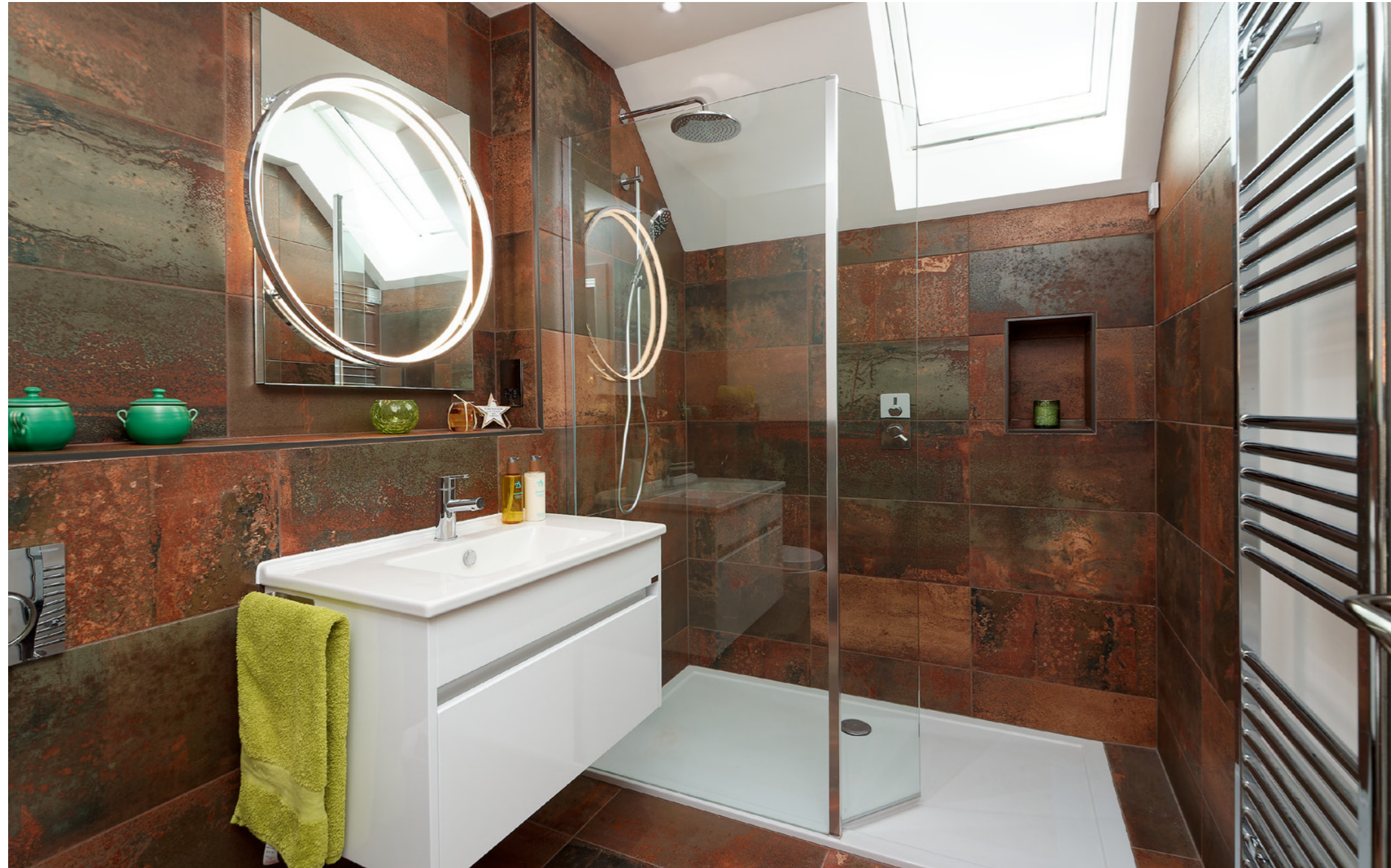
THE SHOWER ROOM