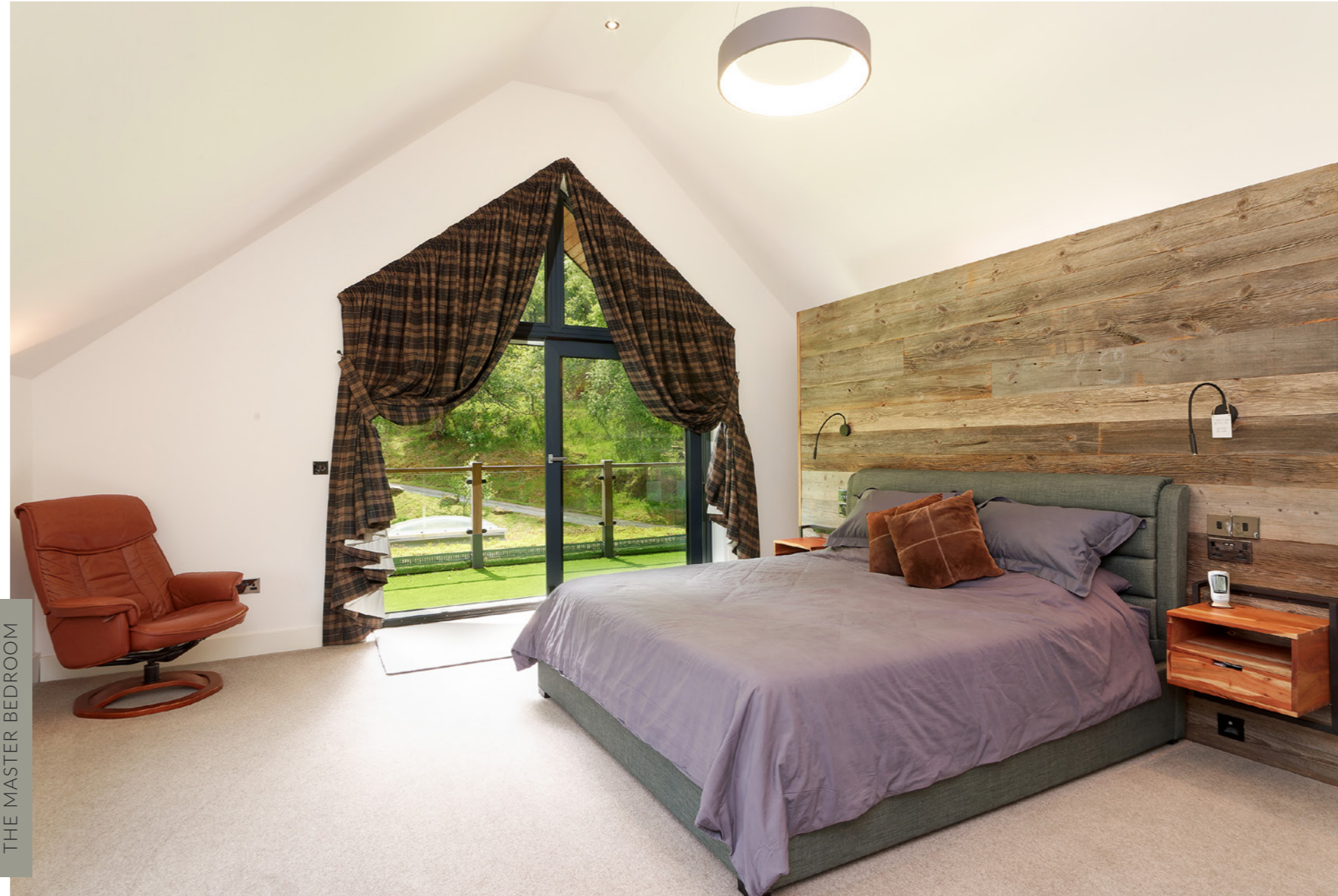
THE MASTER BEDROOM

A striking staircase rises to the first floor, where five generously proportioned bedrooms are arranged. The principal suite is particularly impressive, offering a true five-star experience with expansive dressing rooms and a luxurious en-suite bathroom complete with twin basins, a walk-in shower, and a bath perfectly positioned for stargazing. The suite also benefits from direct access to a private veranda, where far-reaching views across the surrounding landscape can be fully appreciated.