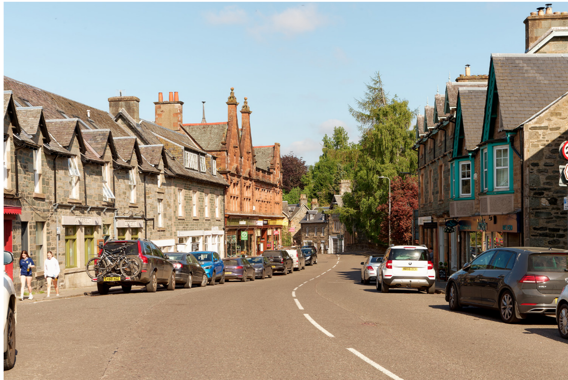
DUNROSGEAL ABERFELDY, PERTHSHIRE, PH15 2EX

Despite being located only approximately one mile from Aberfeldy, the property enjoys a remarkable sense of seclusion. Approached via a private sweeping driveway, it is largely hidden from surrounding vantage points, ensuring privacy while remaining within easy reach of local amenities and services.