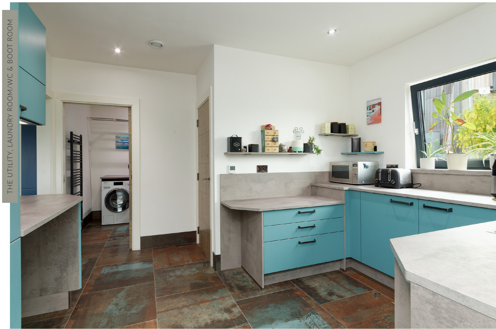
THE UTILITY, LAUNDRY ROOM/WC & BOOT ROOM

Additional ground floor accommodation comprises a separate lounge, utility, laundry room/WC, boot room, and a generous walk-in pantry. The boot room is particularly well suited to rural living, providing practical access for outdoor pursuits and helping to keep the main accommodation clean and well organised.