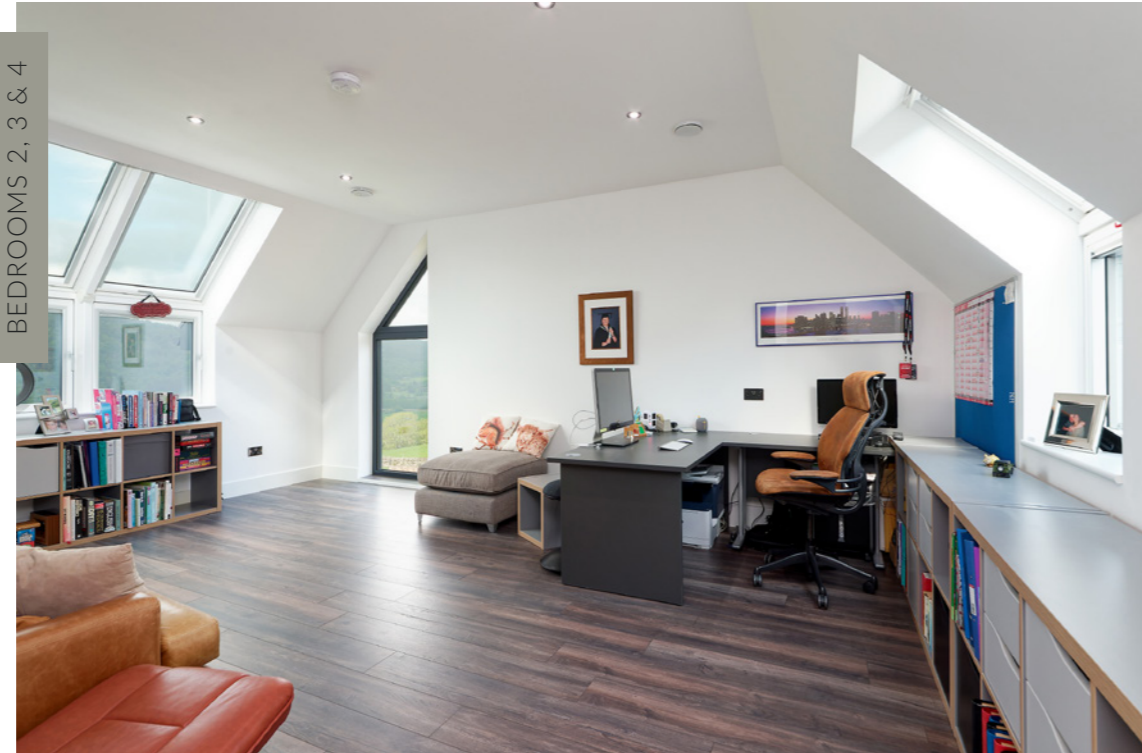
BEDROOMS 2, 3 & 4

The remaining bedrooms are all beautifully appointed, offering excellent proportions, built-in storage and attractive outlooks. One bedroom benefits from its own en-suite shower room, while another has been cleverly configured as a snug or home office, demonstrating the home's versatility. A stylish family shower room completes the first-floor accommodation.