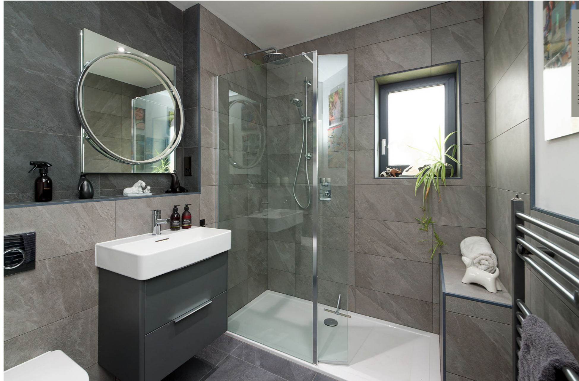
THE SHOWER ROOM