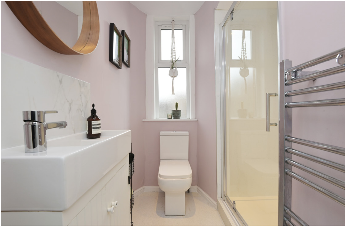
Completing the accommodation is a modern shower room featuring a mains-powered shower, wash hand basin, WC, and heated towel rail.