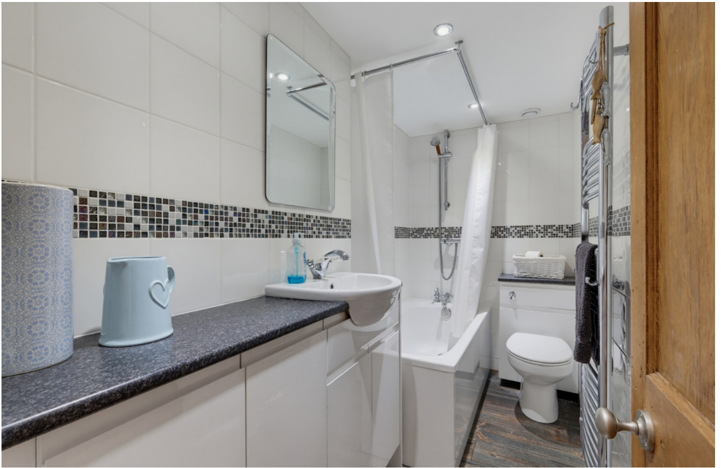
A centrally located three-piece family bathroom, with a shower over the bath, and a double bedroom, completes this floor.