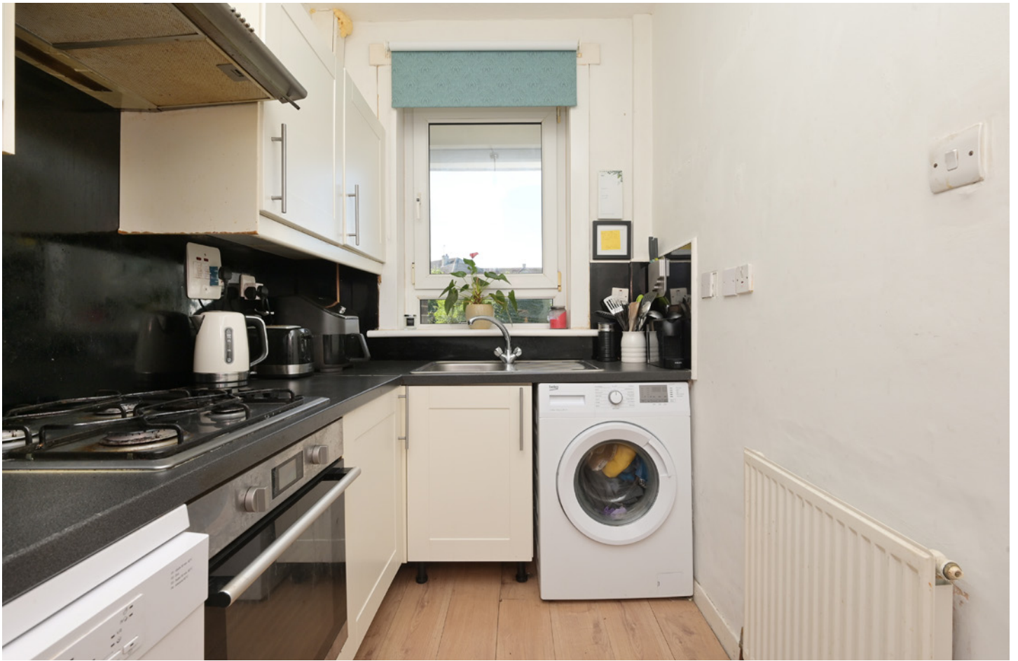
The kitchen is both practical and stylish, fitted with white wood cabinetry, dark grey worktops, and a black splashback.