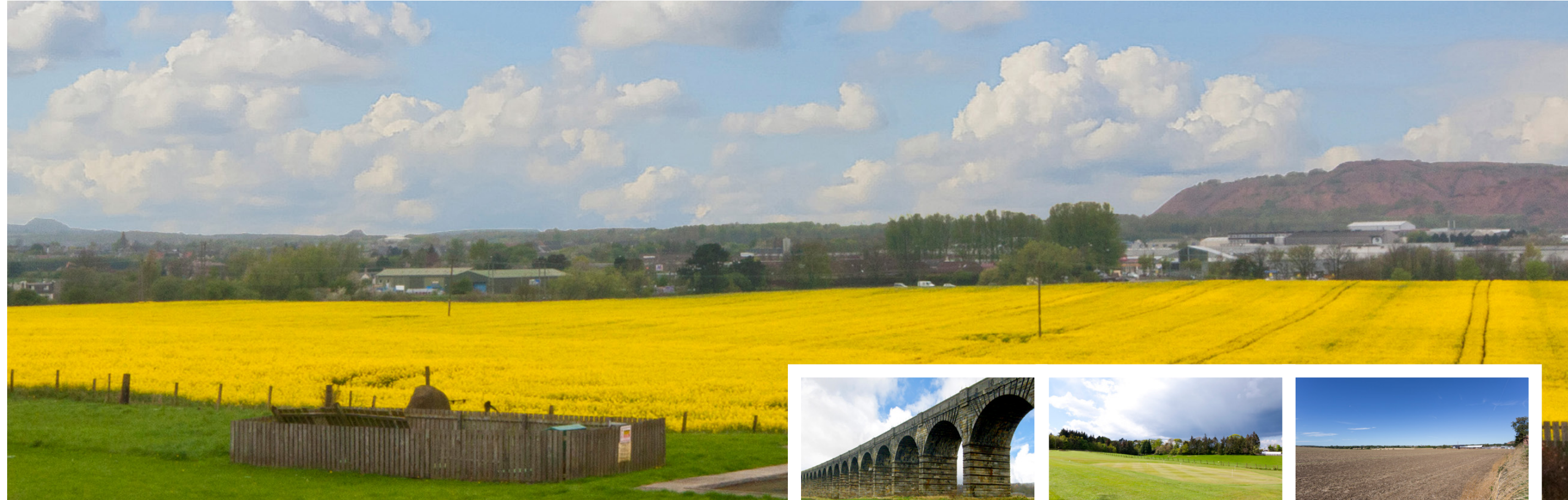
The Arches - Scenes from Broxburn - Oatridge Golf Course - Local fields near the property