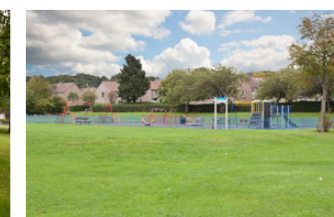
Property Exterior, Scottish National Gallery of Modern Arts & Clermiston Park