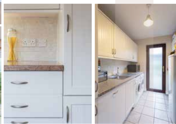
LOUNGE, KITCHEN/DINING ROOM & UTILITY