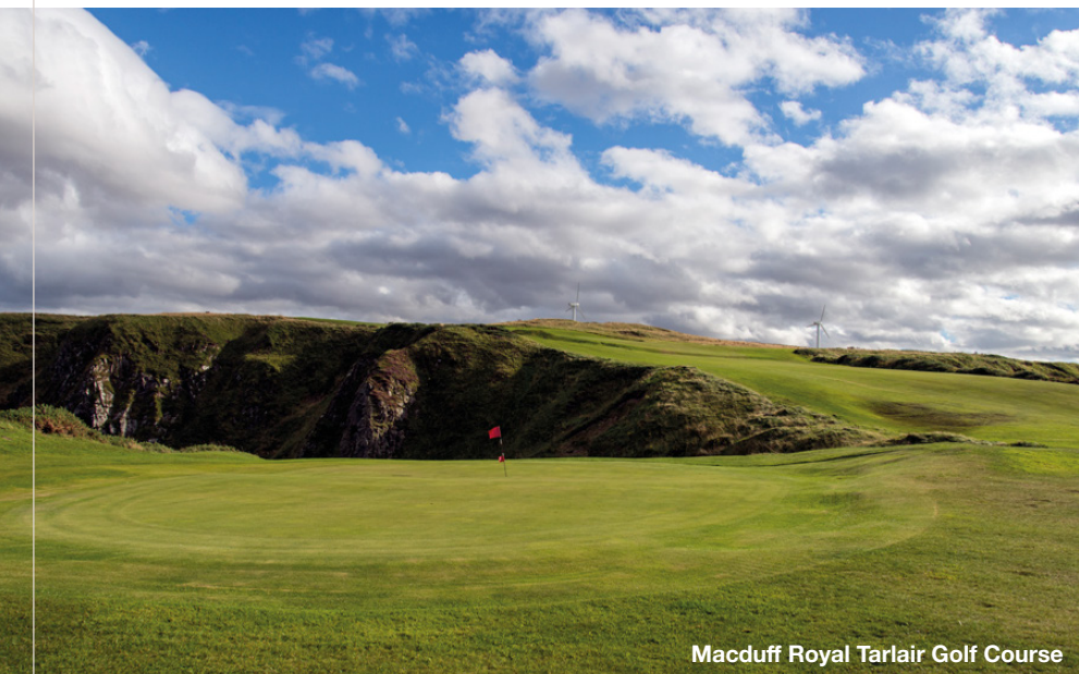
Macduff Royal Tarlair Golf Course