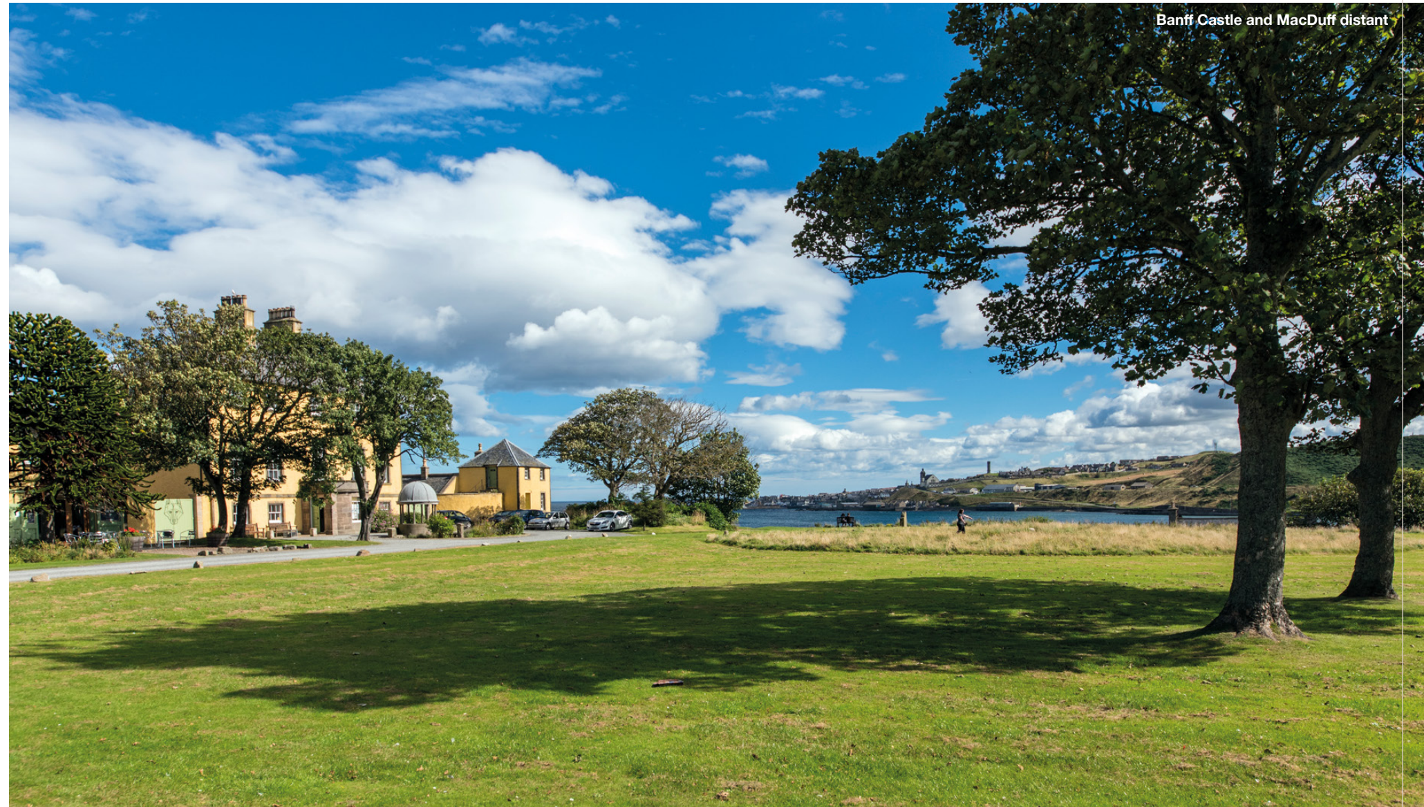
Banff Castle and Macduff distant

The River Deveron is a short drive from this property and is renowned for its salmon and trout fishing. The Angler is spoilt for choice with rivers, beaches, rugged coastline and local harbours to fish. There are also numerous leisure facilities, including a recently opened sports centre available in the area and two immaculate eighteen-hole golf courses. The famous Royal Tarlair is located just a short walk from the property and the Duff House Royal golf course is less than two miles away in the town of Banff.