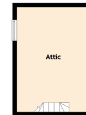
25 Gellymill Street