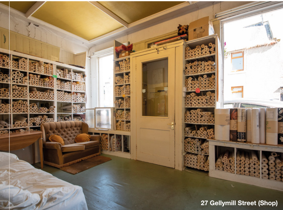
27 Gellymill Street (Shop)