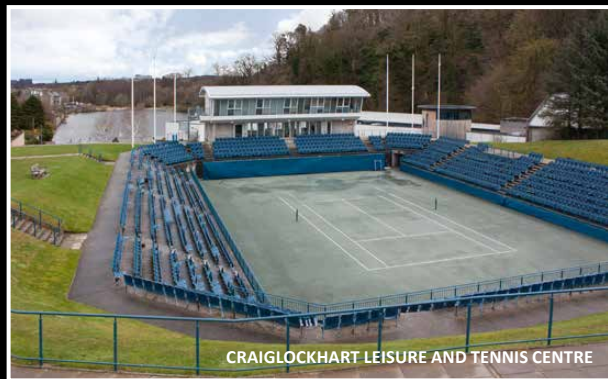
CRAIGLOCKHART LEISURE AND TENNIS CENTRE