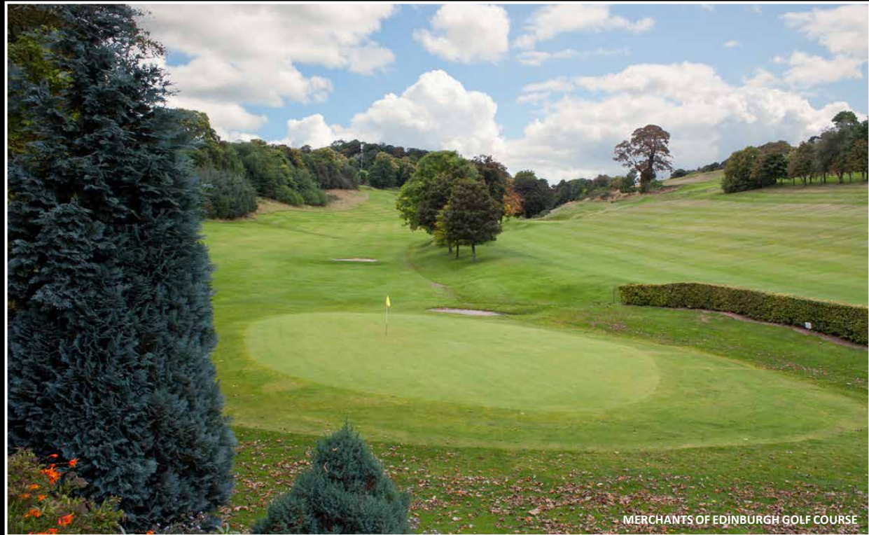
MERCHANTS OF EDINBURGH GOLF COURSE