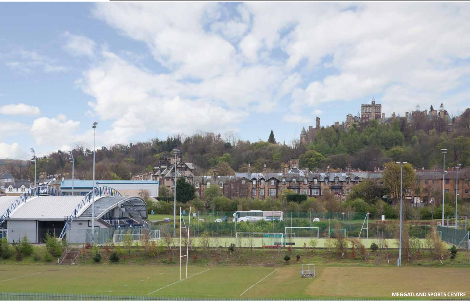
MEGGATLAND SPORTS CENTRE