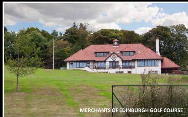
MERCHANTS OF EDINBURGH GOLF COURSE