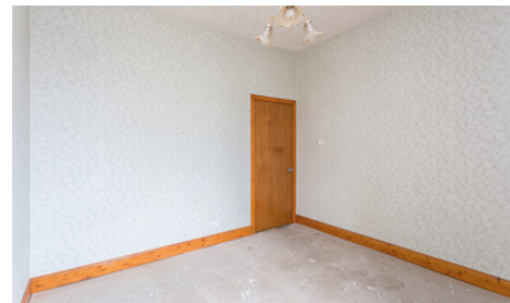
View from Master Bedroom