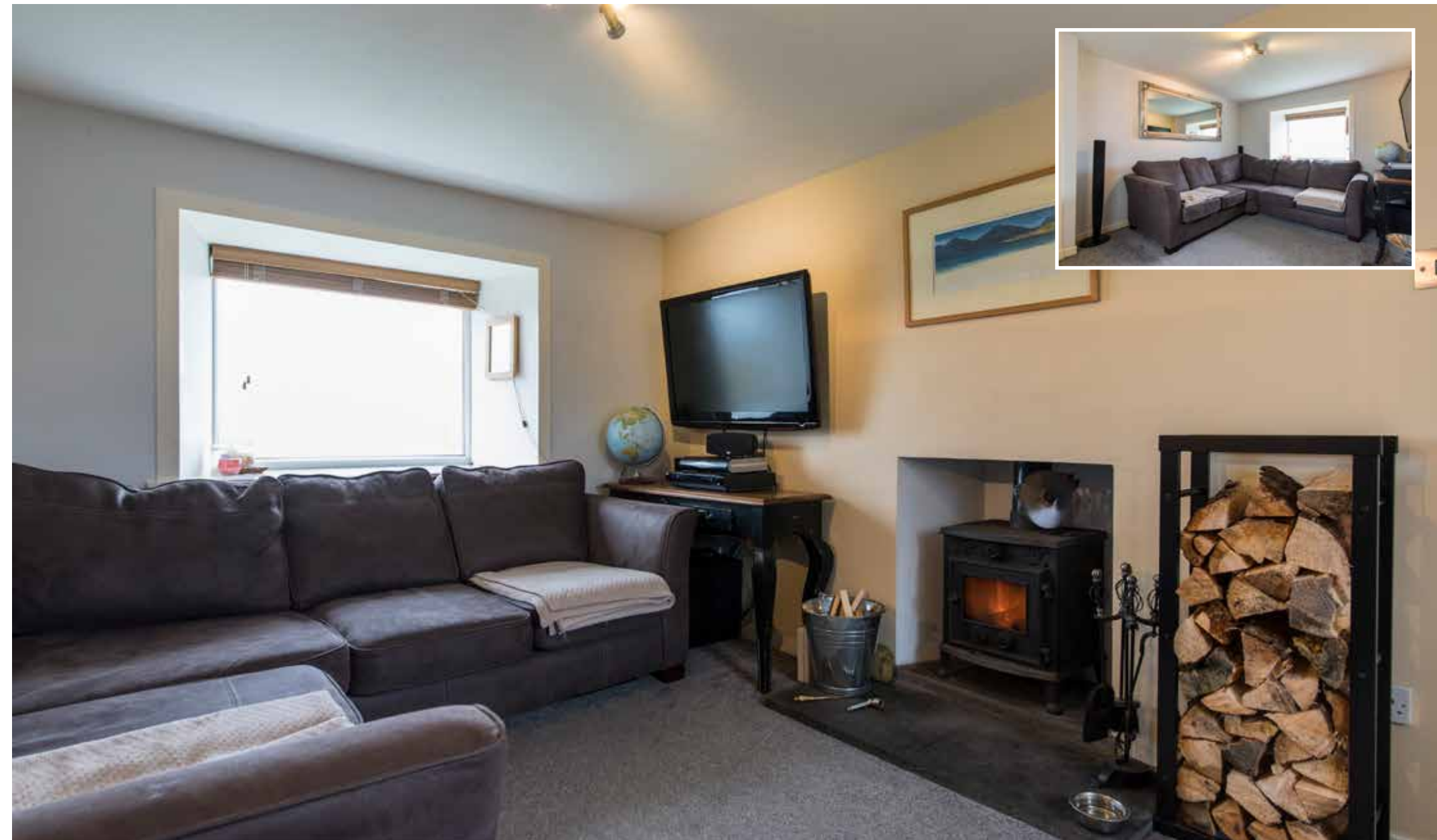
THE CROFTERS SNUG PROPERTY