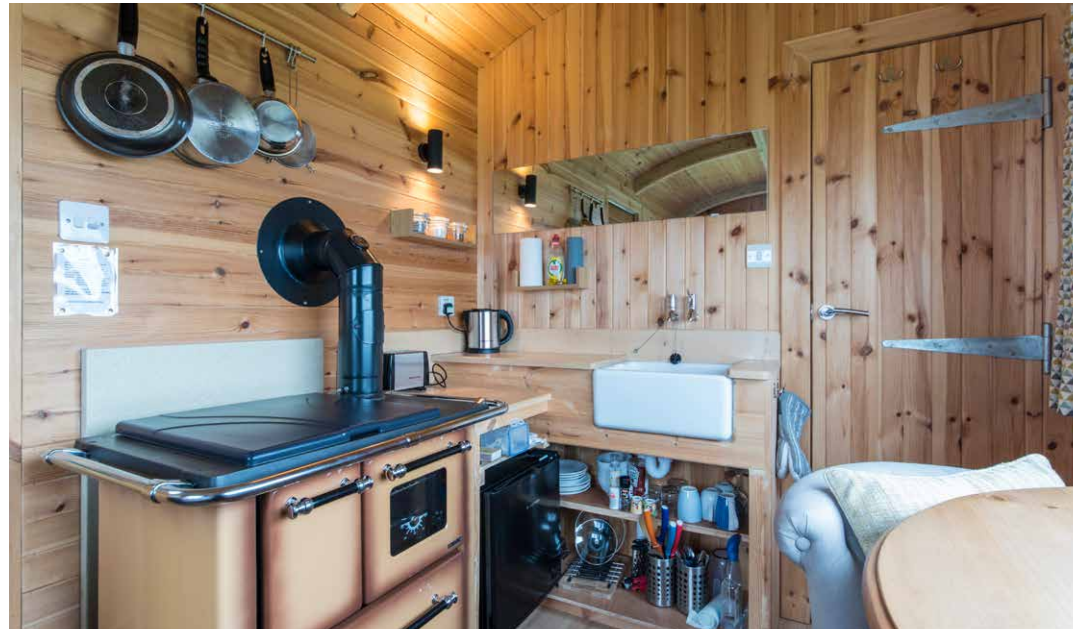
THE CROFTERS SNUG SHEPHERDS HUT