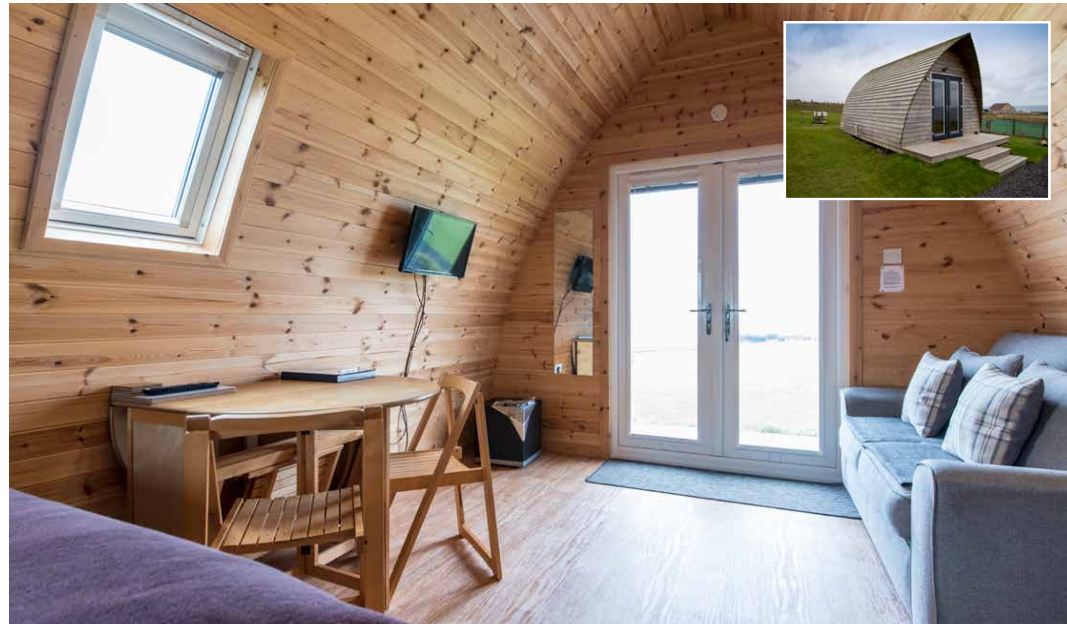
THE CROFTERS SNUG PODS