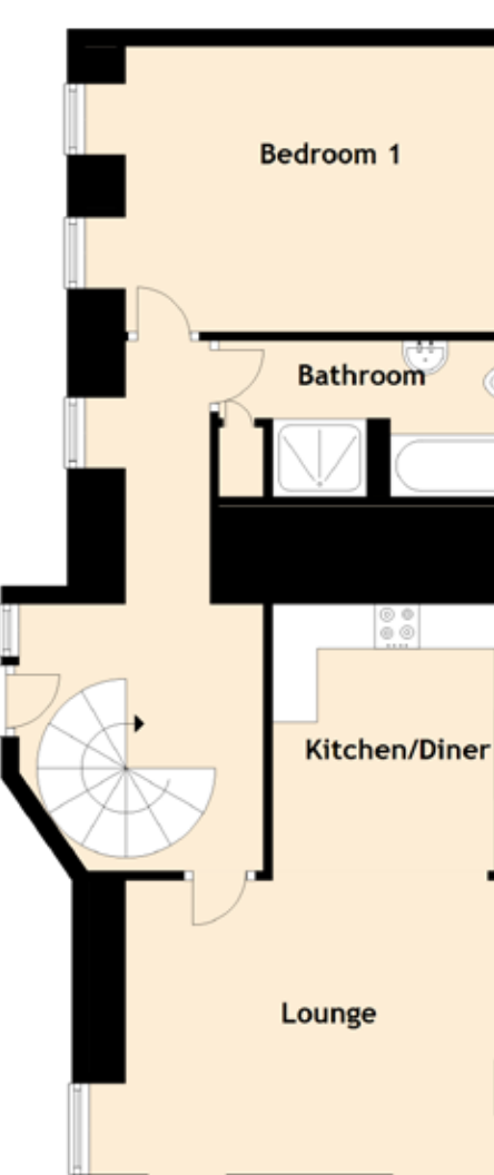
Approximate Dimensions (Taken from the widest point)