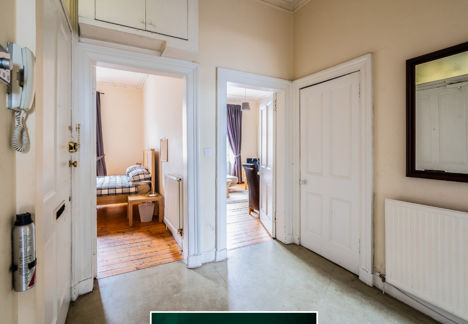
hall & parking