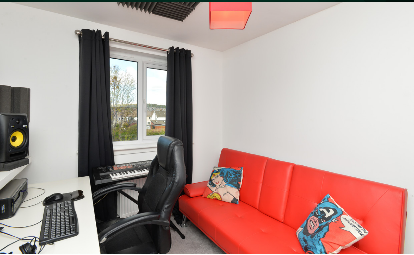
The view from bedroom 2