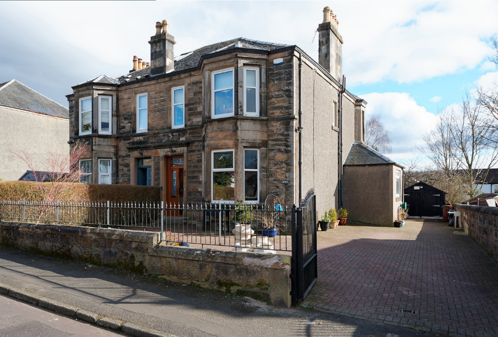
A TRADITIONAL THREE BEDROOM SEMI-DETACHED HOUSE

25 ULUNDI ROAD, JOHNSTONE, RENFREWSHIRE, PA5 8TF