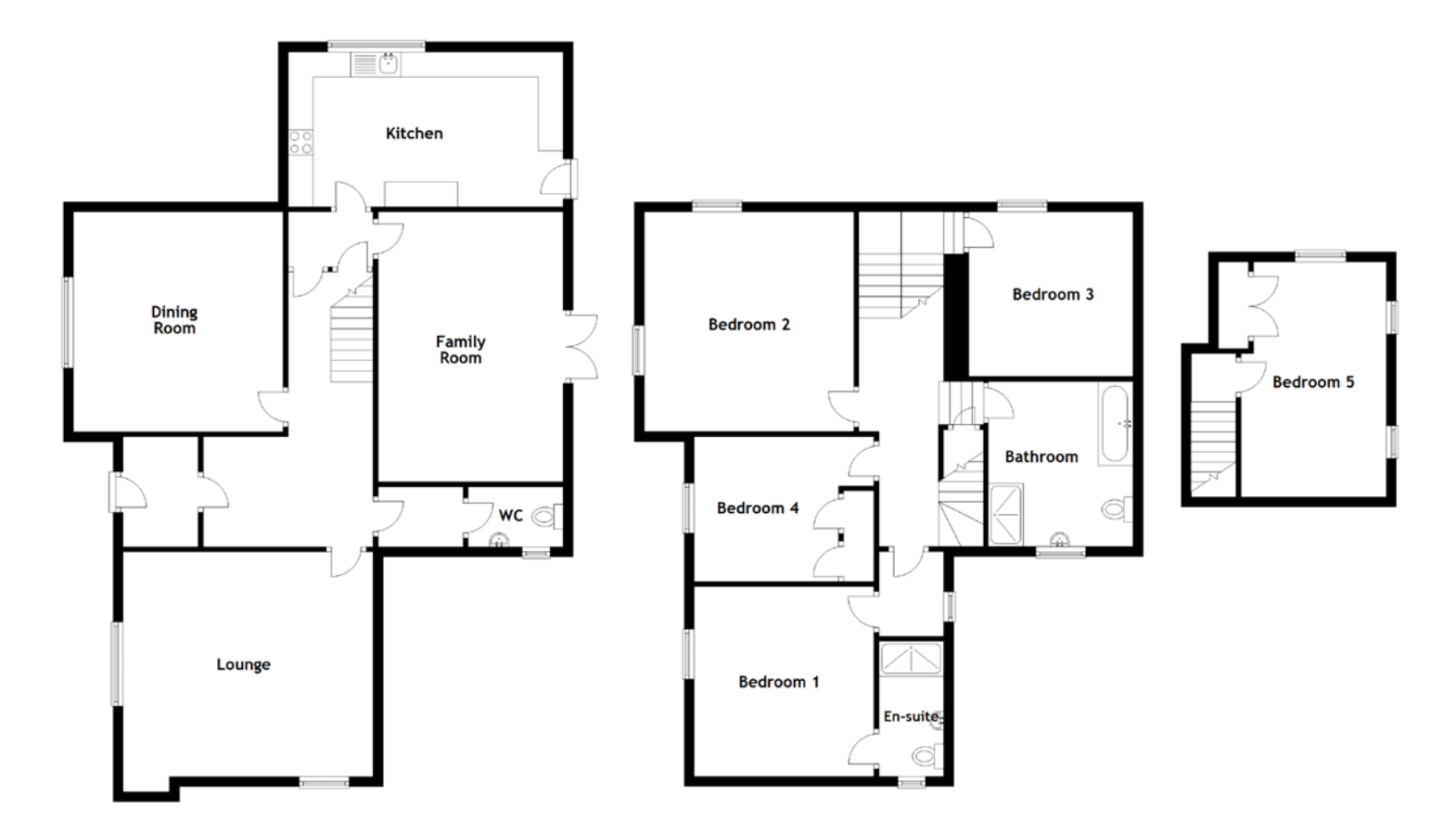
Approximate Dimensions (Taken from the widest point)

Ground Floor Lounge Dining Room Kitchen Family Room WC