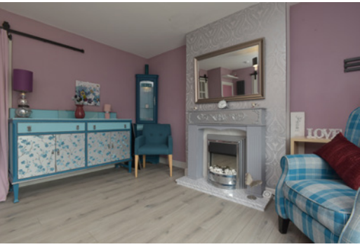
Inside, the property comprises a spacious living room has a large window flooding the room with natural light and offering various possibilities for furniture arrangements.