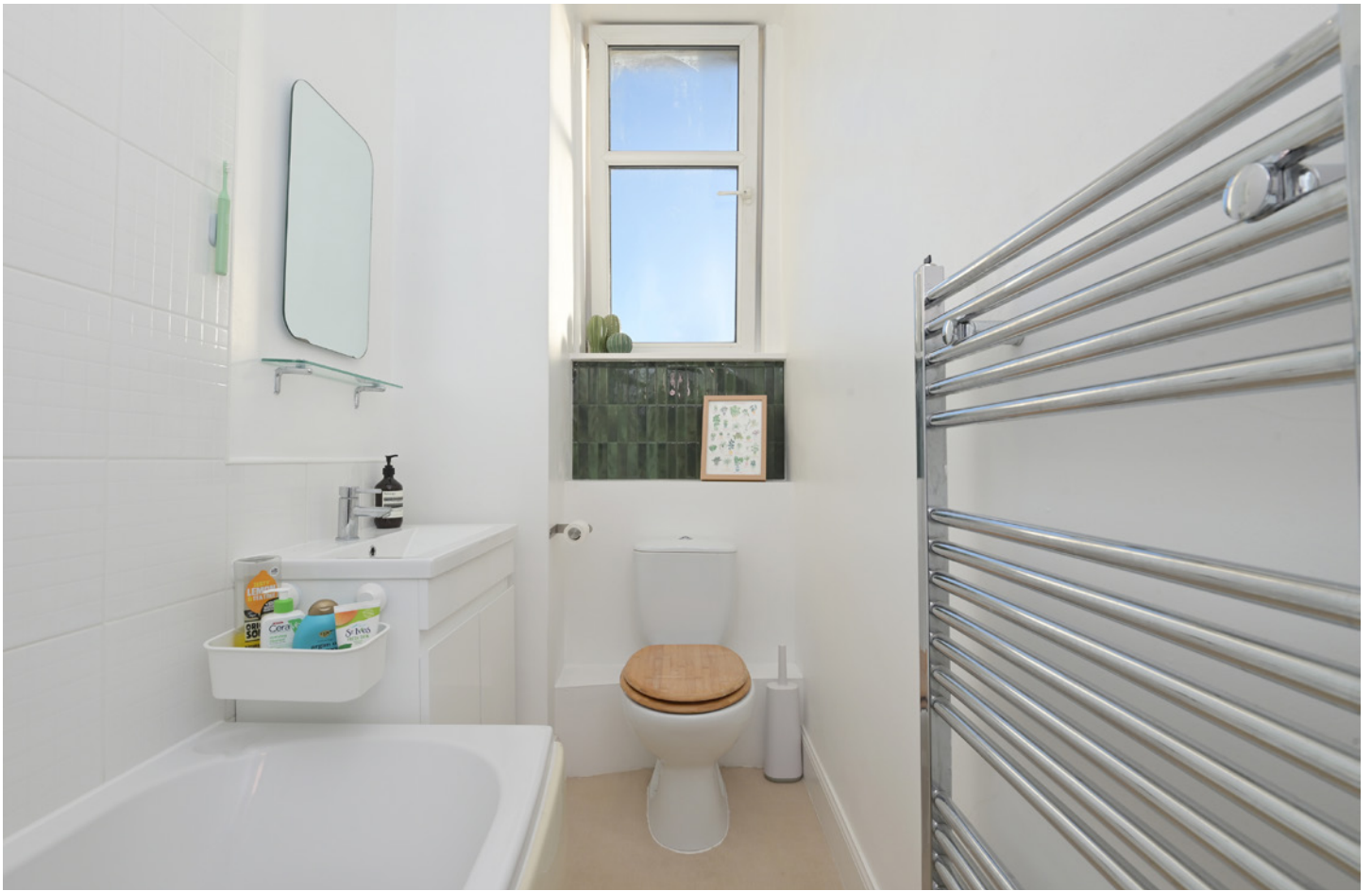
Completing the accommodation is a modern, naturally lit bathroom with partial tiling, a contemporary white suite, and a mains-fed shower over the bath.