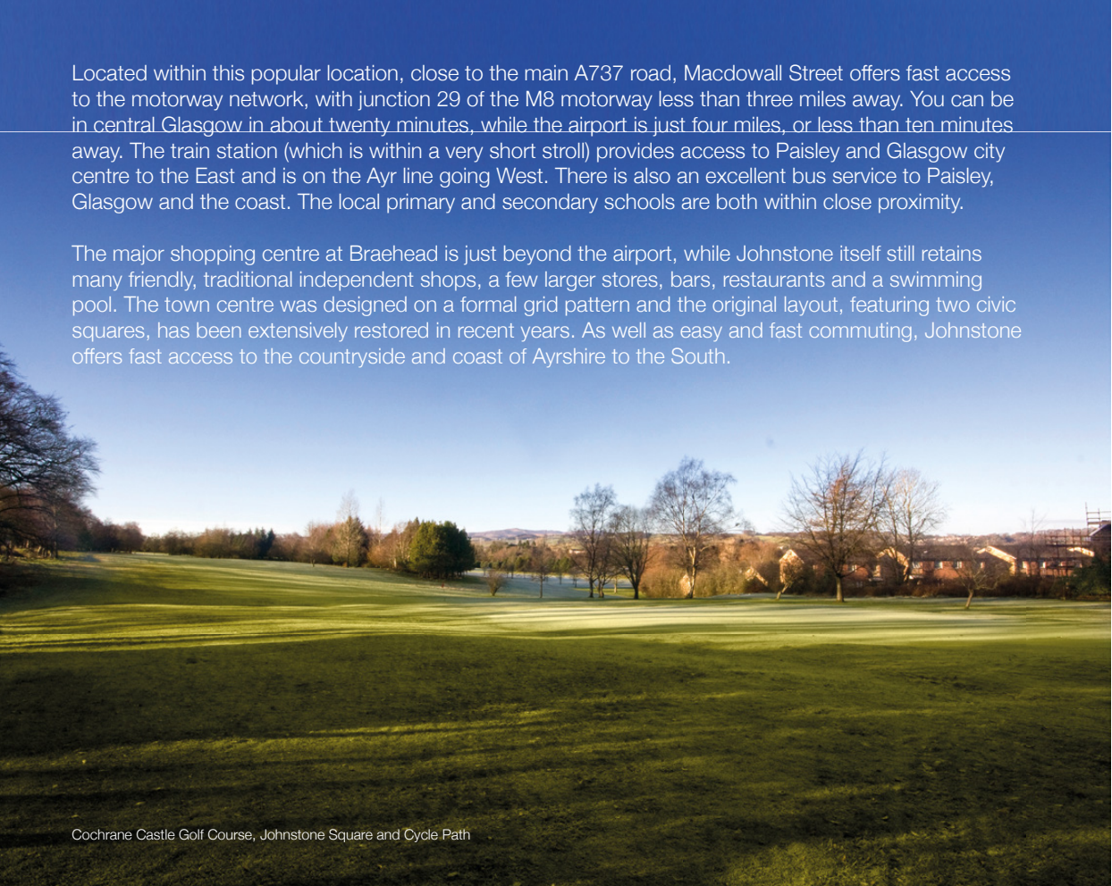
Cochrane Castle Golf Course, Johnstone Square and Cycle Path

The major shopping centre at Braehead is just beyond the airport, while Johnstone itself still retains many friendly, traditional independent shops, a few larger stores, bars, restaurants and a swimming pool. The town centre was designed on a formal grid pattern and the original layout, featuring two civic squares, has been extensively restored in recent years. As well as easy and fast commuting, Johnstone offers fast access to the countryside and coast of Ayrshire to the South.