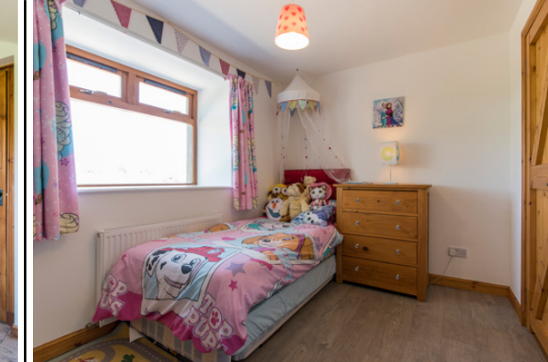
BEDROOMS & OFFICE