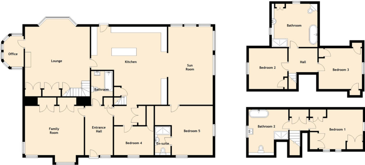
Approximate Dimensions (Taken from the widest point)

A home that is truly beautiful and is an absolute pleasure to live in, early viewings are recommended to appreciate the stunning features and innovative detail.