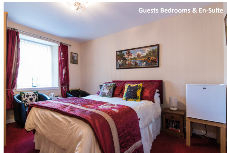
Guests Bedrooms & En-Suite