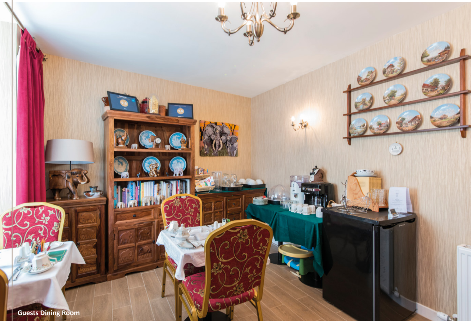
Guests Dining Room