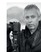
Professional photography ANDY SURRIDGE Photographer