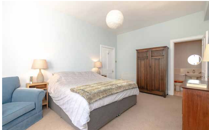
BEAUTIFULLY PRESENTED TWO BEDROOM BASEMENT FLAT IN EDINBURGH'S DESIRABLE NEW TOWN.